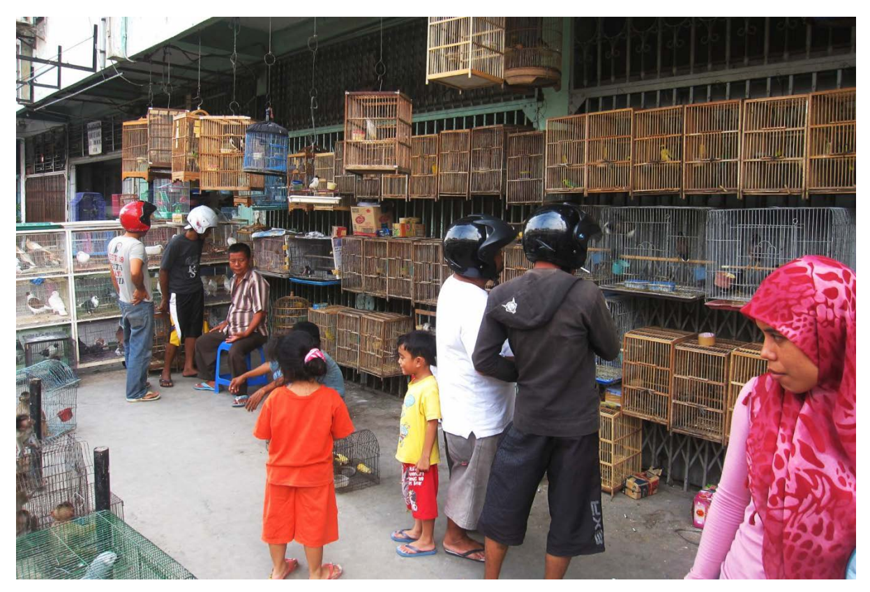
Plate 1. A typical shopfront at Jalan Bintang, Medan.

All pieces of information were anonymously written down by vendors after each transaction using record sheets provided by us and collected by the middleman. Verification of these data was carried out where possible by back-checking of records when the exact date and number of sold SLs was known and communicated through the network of local bird-holder friends. Variation in mortality rates across time and vendors was assessed by one-way ANOVA and Tukey's HSD post-hoc tests. Because of the probability that the health of individual birds in the typically small cages deteriorated with an increase in stocking rate, we used Spearman's rank-order correlation to examine the relationship between mortality rate and the number of purchased SL individuals by individual vendors.