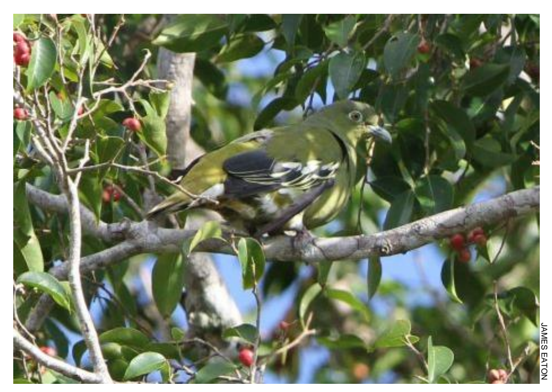
Plate 1. Lateral view of a Timor Green Pigeon perched in a fruiting fig tree in Timor-Leste.

On 14 December 2013, SC observed two Timor Green Pigeons in a degraded forest patch (10°34'10'S, 123°18'48"E) bordering an open area in woodland about 1 km south of Daurendale-Sotimori. At a landscape level, this woodland merged into denser tropical dry forest over less than one kilometre. The birds were seen at close range perching in the top of a broadleaf tree, giving typical "see-saw" notes and bubbling and gargling sounds. SC obtained some sound recordings of the call (Cooleman 2013: XC177361). On at least one individual the plumage was greenish, except for the black secondaries, and broad yellowish edges to the wing coverts were clearly visible, as well as the brownish-orange iris, and pale blue-grey eye-ring and bill colour (cf. Plates 1 and 2, from Timor-Leste). This was SC's only observation of this species during four days spent in the northern forested part of Roti.