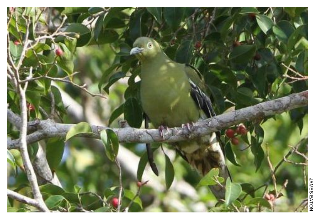
Plate 2. Frontal view of a Timor Green Pigeon (same bird as Plate 1)..