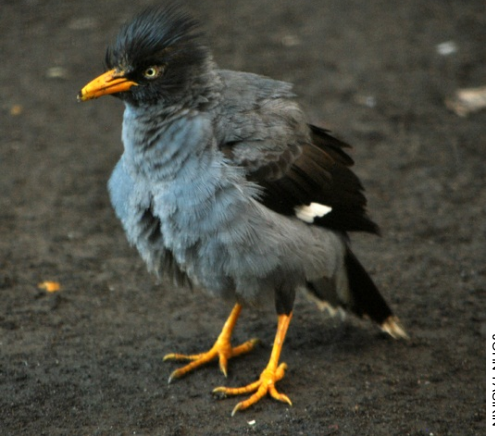
Plate 4 . Pale-bellied Myna, Bitung, North Sulawesi.

On 12 July 2014, JST observed six individuals of Pale-bellied Myna in a large chicken-wired enclosure (4 m wide x 8 m long x 6 m high) in Bitung, North Sulawesi (1°27'36" N, 125°12'36" E) (Plate 4). Bitung is about 50 km east of Kalasey and about 30 km east of the Manado airport. The keeper said that they had been brought by local farmers a couple of months earlier (during May 2014). There was no certainty about the place where the birds had been captured but it may be assumed that it was near Bitung.