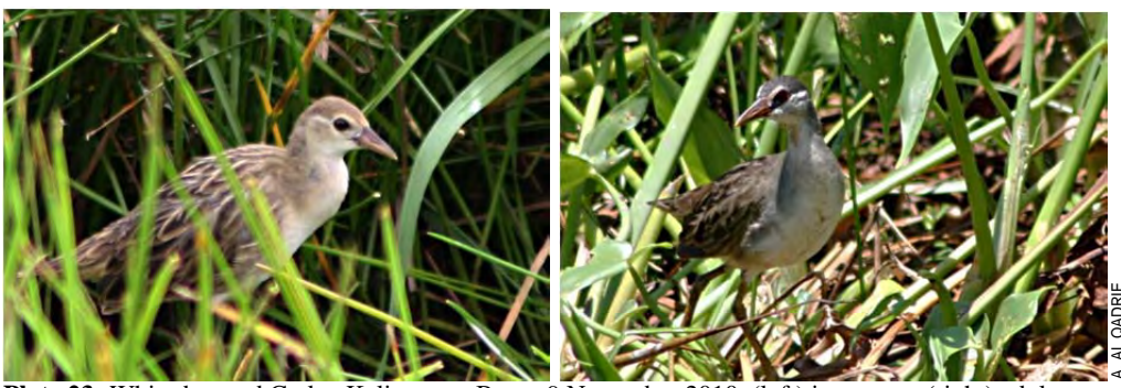
Plate 23: White-browed Crake, Kalimantan Barat, 9 November 2010, (left) immature, (right) adult.

Two adult WHITE-BROWED CRAKES Porzana cinerea with three juveniles were seen on 14 March 2007 in a disused, duckweed-covered waste pond near a palm oil mill near Sanggau, Kalimantan Barat; adults continued to be seen from 12 to 18 March (LKC, JH, DY]. Two crakes were photographed (Plate 23) on 9 November 2010 at Pematang Gadung, amongst four that were seen at the border of a rice field [AQ]. These are first provincial records.