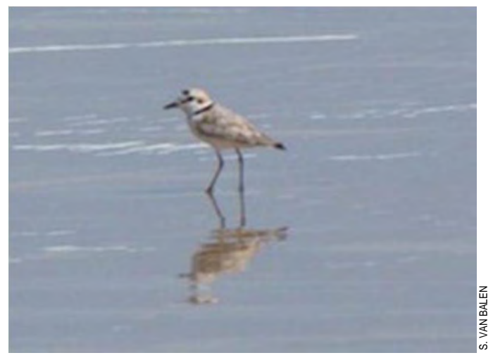
Plate 36: Malaysian Plover, Banten, 3 May 2012.

One MALAYSIAN PLOVER Charadrius peronii was seen on the southern sand beach of Ujung Kulon, Banten, on 3 May 2012 (Plate 36) [SvB]; there are few confirmed records from Java.