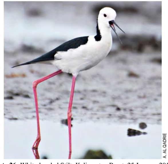
Plate 26: White-headed Stilt, Kalimantan Barat, 25 January 2013.

Several WHITE-HEADED STILTS Himantopus leucocephalus were seen at Air Hitam, Ketapang, Kalimantan Barat, on 25 January 2013 [AQ, FJ; Plate 26]; this is the first provincial record.