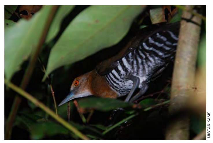
Plate 2: Slaty-legged Crake, Aceh, 28 November 2012.

A SLATY-LEGGED CRAKE Rallina euryzonoides , was photographed (Plate 2) during a nocturnal survey on 28 November 2012 in a small forest patch at Lamie (Nagan Raya, Aceh) [MK]; there are few Sumatra records of this species, and this constitutes the first for the province.