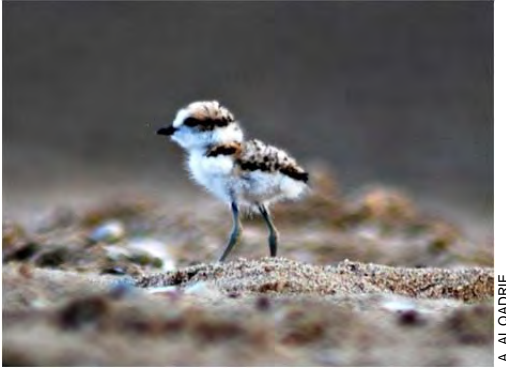
Plate 47: Malaysian Plover chick, Kalimantan Barat, (left) June 2011, (right) July 2012.