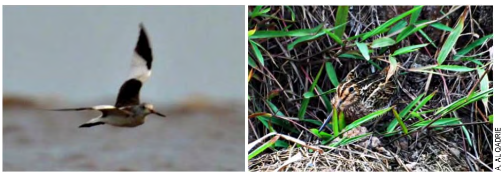
Plate 25: Greenshank (left), Kalimantan Barat, 6 April 2011; Swinhoe's Snipe (right), Kalimantan Barat, 3 October 2012.

A SWINHOE'S SNIPE Gallinago megala was photographed on 3 October 2012 near Ketapang, Kalimantan Barat (Plate 25, right) [AQ], of which the relatively set-back eyes, broad supercilium and long bill were diagnostic features. One snipe with clearly visible white trailing edges to the wings was flushed from a pineapple field, south of Pontianak, Kalimantan Barat, on 21 March 2010 was identified as COMMON SNIPE Gallinago gallinago [PW, LN, MF, IC]. These are the first provincial records of both snipe species.