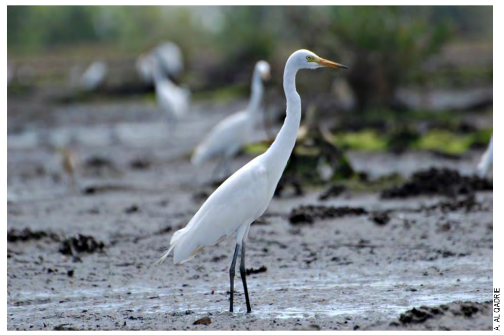
Plate 13: Intermediate Egret, Kalimantan Barat, 25 January 2013.

A single GREY HERON Ardea cinerea was observed on the river bank adjacent to a nipa swamp in Sungai Kakap in the Sei Nyamuk delta, Kalimantan Barat, on 6 September 2009 [PW]; this is the first provincial record, and the second record for Indonesian Borneo. The INTERMEDIATE EGRET Egretta intermedia was first reported from Kalimantan Barat at Danau Sentarum lakes (van Balen & Dennis 2000); on 25 January 2013 many were seen associating with Little and Great Egrets in mangrove swamps of Air Hitam, Ketapang, Kalimantan Barat [Plate 13; AQ].