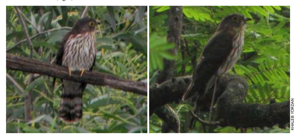
Plate 38: Hodgson's Hawk-Cuckoo, immature, Jakarta, 7 December 2009.