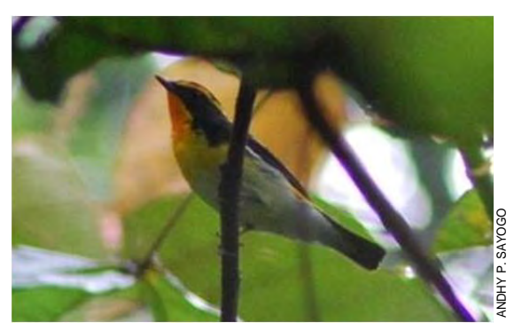
Plate 32: Narcissus Flycatcher, Kalimantan Tengah, 7 February 2011.

Many EYE-BROWED THRUSHES Turdus obscurus were seen feeding on berries of a tree in the forest at Bukit Tungal near Nyangdang village, Sanggau, Kalimantan Tengah, on 17 March 2007 [LKC, JH, DY]. This sighting constitutes the first record for Kalimantan, and is followed by an observation of c. 20 on Maratua Island, Kalimantan Timur, in January 2011 (Phillipps & Phillipps 2011).