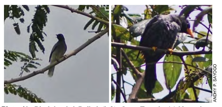
Plate 41: Black-headed Bulbul (left), Jawa Tengah, 16 November 2010; Grosbeak Starling (right), Jawa Barat, 9 April 2010.