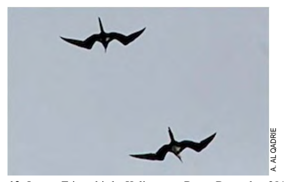
Plate 12: Lesser Frigatebirds, Kalimantan Barat, December 2011.

Two LESSER FRIGATEBIRDS Fregata ariel were seen near Ketapang, Kalimantan Barat, on 19 or 20 December 2011 [AQ], a first provincial record (Plate 12).