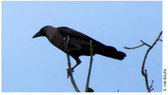
Plate 10: House Crow, 25 November 2012, Percut, Sumatera Utara.

On 28 September 2005 three HOUSE CROWS Corvus splendens were observed, and another on 1 October, at the Penang Ferry terminal at Belawan [AC, AS]. In the same area a single bird was seen and photographed (Plate 10) in trees bordering a fish pond on 25 November 2012 [SvB, MK]. These observations follow an old record in 1998 [CS] by Shepherd (1999) at the port of Belawan, only c . 15 km north of Percut. The individual seen in 2012 had a thin metal ring, indicating it had been captive. It is surprising that the House Crow, locally very common in nearby Malaysia and very capable of crossing sea straits, is apparently still very scarce on Sumatra.