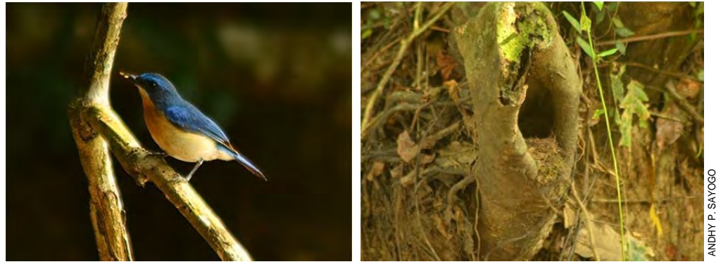
Plate 49: Malaysian Blue Flycatcher carrying food (left) to nest hole (right), 25 August 2011, Kalimantan Timur.

On 25 August 2011 a female MALAYSIAN BLUE FLYCATCHER Cyornis turcosus was seen near Samarinda (Kalimantan Timur) attending a nest with two young in a tree hole (Plate 49) [APS]