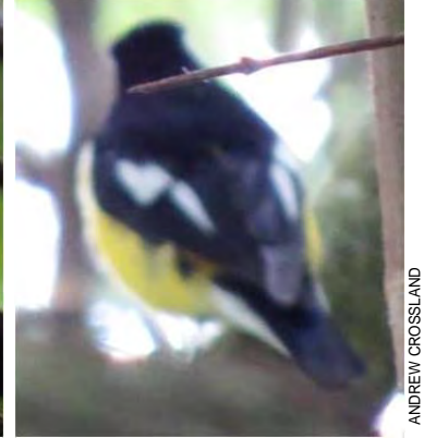
Plate 8: Yellow-rumped Flycatcher, Sumatera Utara, 27 November 2012.