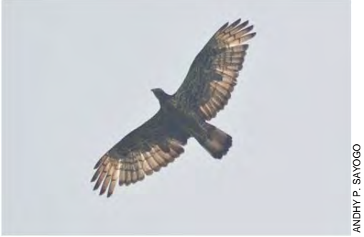
Plate 42: Oriental Honey Buzzard, Jambi, 26 June 2011, nest (left) and adult male (right).

In the Sipaku ricefields, near Tanjung Balai Asahan, Sumatera Utara, a nest with a single egg of COMMON MOORHEN Gallinula chloropus was found in a dense bed of rice on 9 October 2010 (Plate 43); the adults were described accurately by the farmer, and the egg matches field guide illustrations of moorhen eggs [AC].