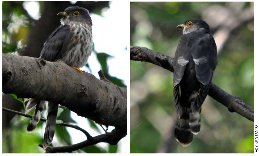
Plate 37: Hodgson's Hawk-Cuckoo, Jakarta, adult, 14 December 2010. Note the yellow bill tip (left) and white tertials (right).