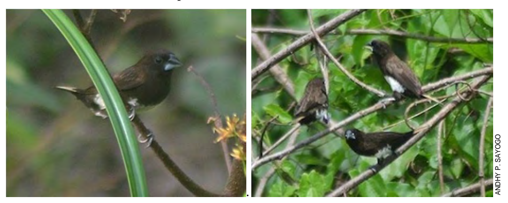
Plate 11: White-bellied Munias, Jambi, 26 June 2011.

On 26 June 2011, a pair of WHITE-BELLIED MUNIAS Lonchura leucogastra was seen perched in a Eupatorium sp bush in Lubuk Beringin Village, Merangin District, Jambi (2°14'S, 101°59'E); on the same day, more than 30 individuals were found in a rice field near forest, c. 300 m away (Plate 11) [APS]. There are few Sumatran records of this species (van Marle & Voous 1988), and this constitutes the first for Jambi province.