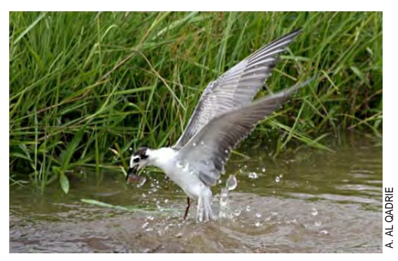
Plate 27: White-winged Tern, Kalimantan Barat, 22 November 2010.

Three BLACK-HEADED GULLS Larus ridibundus were perched on wooden pillars in the port area of Sungai Kakap in the northern Sei Nyamuk delta, Kalimantan Barat, on 15 January 2011; two were still present on 23 January (Widmann et al. 2011). WHITE-WINGED TERNS Chlidonias leucopterus were seen in Pematang Gadung, Kalimantan Barat, on 4 January 2010, and were photographed on 22 November 2010 (Plate 27) [AQ]. These are first provincial records.