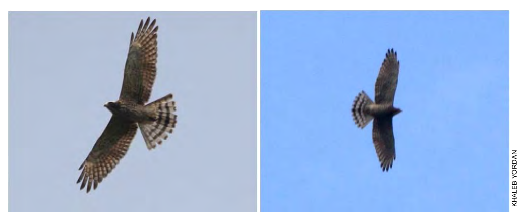
Plate 35: Grey-faced Buzzard, Puncak (left), Jawa Barat, 30 October 2012; Ragunan Zoo (right), Jakarta, 1 March 2013.