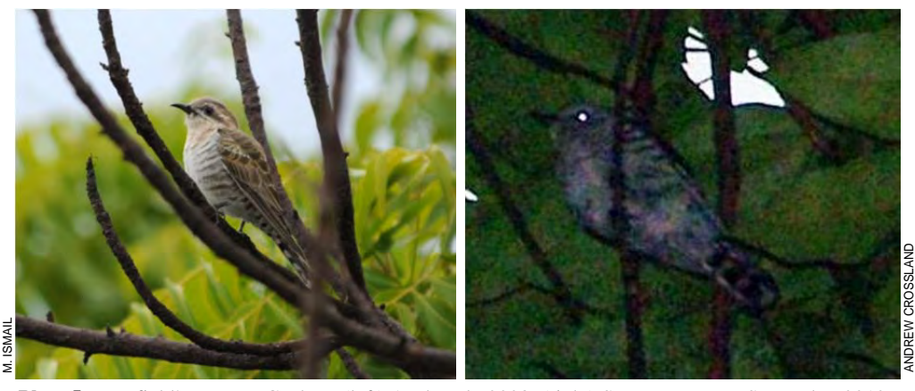
Plate 5: Horsfield's Bronze-Cuckoo, (left) Aceh, July 2008; (right) Sumatera Utara, September 2010.

A total of 21 HORSFIELD'S BRONZE CUCKOO Chrysococcyx basalis was seen in July 2008 in shrubland near Gampong Baro village, Aceh Besar Regency (Plate 5, left) [MaI]. More recently a single bird (Plate 5, right) was seen on 23 September 2010 in a eucalypt plantation and roadside trees along the Pematang Siantar – Parapat road, Sumatera Utara [AC, AS]. There only four previous records for Sumatra (cf. van Marle & Voous 1988; Holmes 1996), and these are the first for Aceh and Sumatera Utara provinces. An early arrival date of 3 September was recorded in 2006 for ASIAN KOEL Eudynamys scolopacea in the Tanjung Balai Asahan area [AC].