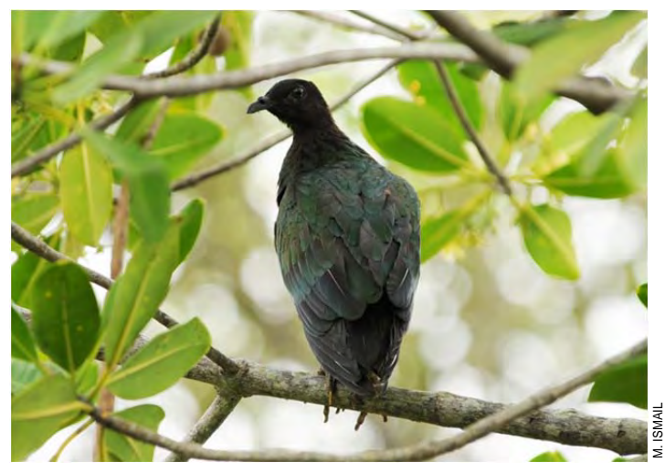
Plate 4: Nicobar Pigeon, Aceh, July 2008.

A total of 21 HORSFIELD'S BRONZE CUCKOO Chrysococcyx basalis was seen in July 2008 in shrubland near Gampong Baro village, Aceh Besar Regency (Plate 5, left) [MaI]. More recently a single bird (Plate 5, right) was seen on 23 September 2010 in a eucalypt plantation and roadside trees along the Pematang Siantar – Parapat road, Sumatera Utara [AC, AS]. There only four previous records for Sumatra (cf. van Marle & Voous 1988; Holmes 1996), and these are the first for Aceh and Sumatera Utara provinces. An early arrival date of 3 September was recorded in 2006 for ASIAN KOEL Eudynamys scolopacea in the Tanjung Balai Asahan area [AC].