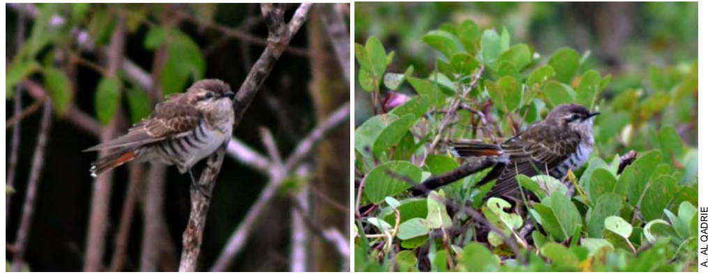
Plate 28: Horsfield's Bronze-cuckoo, Kalimantan Barat, 5 June 2012.

In the mangroves of Pantai Air Mati a HORSFIELD'S BRONZE CUCKOO Chrysococcyx basalis was observed during 1-5 June 3012 [AQ] (Plate 28). This is the first record for Kalimantan Barat.