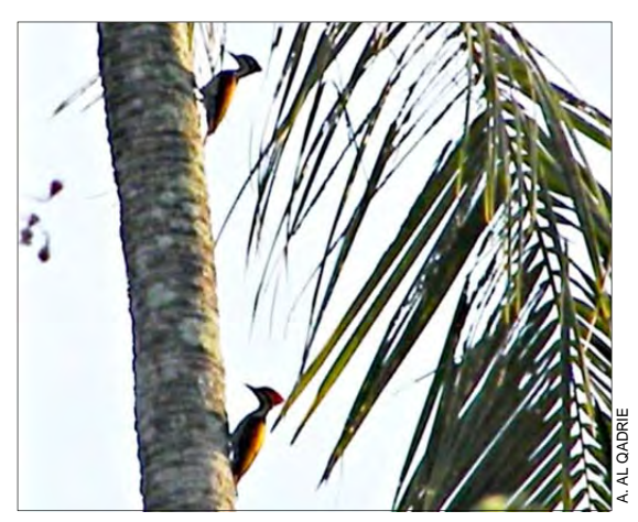
Plate 31: Common Goldenback, Kalimantan Barat, 10 October 2009.