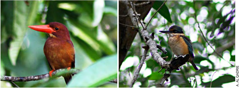
Plate 30: Ruddy Kingfisher (left), Kalimantan Barat, 18 December 2010; Sacred Kingfisher (right), Kalimantan Barat, 3 September 2011.