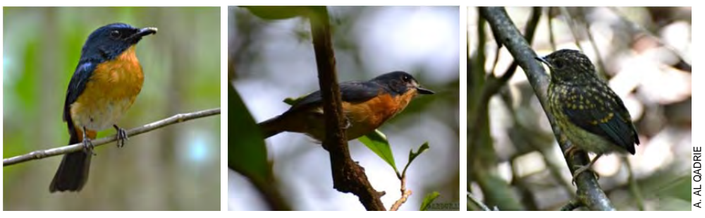
Plate 50: Mangrove Blue Flycatcher, Kalimantan Barat, 12 March 2011, (left) male, (centre) female, (right) fledgling.

On 1 April 2011 a flock of JAVAN WHITE-EYES Zosterops flavus was seen with a fledgling which was fed by one of the adults (Plate 51) in the neighbourhood of Pematang Gadung village, Ketapang, Kalimantan Barat; an adult was seen carrying nest materials on 9 August 2011 [AQ].