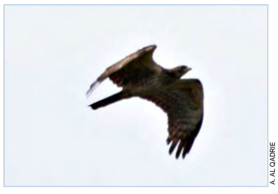
Plate 18: Oriental Honey Buzzard, juvenile, Kalimantan Barat, 13 December 2010.