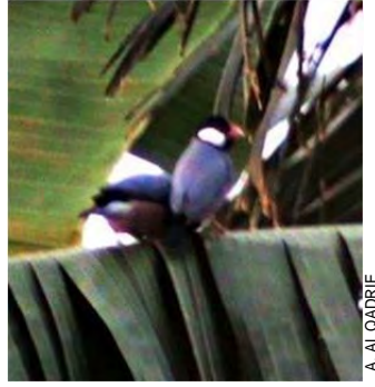
Plate 33: Pale-bellied Mynas (left), Kalimantan Barat, 11 February 2011; Chestnut-cheeked Starling (centre), Kalimantan Barat, 17 December 2009; Java Sparrows (right), Kalimantan Barat, 16 December 2009