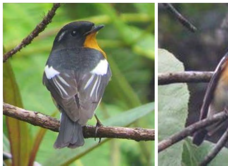
Plate 9: Mugimaki Flycatchers, Sumatera Utara, 26 November 2012.

Two BLACK-HOODED ORIOLES Oriolus xanthornus were watched for several minutes at close range on forest edge close to Hutan Diklat (Pondok Bulu) park headquarters and farmland, Pematang Siantar – Parapat road on 18 October 2010 [AC, AS]. There have been no confirmed records of this species from Sumatra since early 20<sup>th</sup> century (Holmes 1996), where it was found very common along the coast of Deli Serdang and Labuan at the turn of the century (van Heyst 1919; Robinson & Kloss 1920; van Marle & Voous 1988).