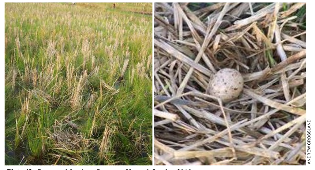
Plate 43: Common Moorhen, Sumatera Utara, 9 October 2010.

In the Sipaku ricefields, near Tanjung Balai Asahan, Sumatera Utara, a nest with a single egg of COMMON MOORHEN Gallinula chloropus was found in a dense bed of rice on 9 October 2010 (Plate 43); the adults were described accurately by the farmer, and the egg matches field guide illustrations of moorhen eggs [AC].