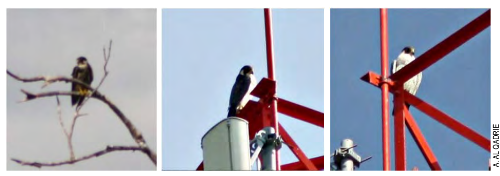
Plate 20: Peregrine Falcons, Kalimantan Barat, (left) 13 November 2010; (centre, right) 10 October 2011.

On 13 November 2010 a single PEREGRINE FALCON Falco peregrinus was photographed (Plate 20, left) in the Hutan Kota area, Ketapang; another was photographed (Plate 20, centre, right) on 10 October 2011 along the main road from Pelang south to Pematang Gadung, and was seen again at the same locality in October 2012 [AQ]; these sightings confirm a tentative record from the Danau Sentarum area (Sebastian 1993, in van Balen & Dennis 2000). The dark underparts on the bird at left suggest the resident race ernesti , whereas the clear moustache and pale underparts on the bird at centre suggest the migratory race calidus .