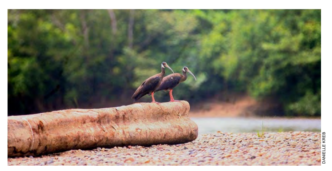
Plate 16: White-shouldered Ibises, Kalimantan Timur, 31 August 2007.