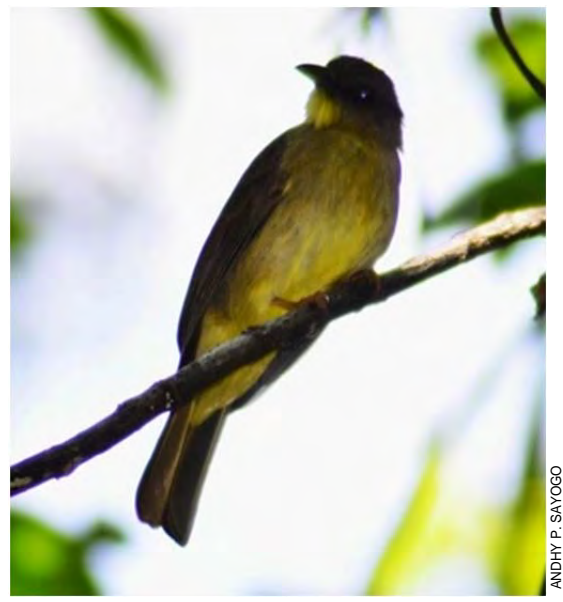
Plate 6: Finsch's Bulbul, 22 October 2011, Jambi.

Since FINSCH'S BULBUL Criniger finschi was first reported in the provinces of Sumatera Utara and Jambi (van Balen 2001), more observations have been made of this apparently largely overlooked bulbul. On 22 October 2011 a single bird was observed in Jambi (Plate 6) [APS]. During a survey on a Batangtoru pre-mining site, singles and pairs were seen and tape-recorded on 21 and 24 June 2003 [SvB; XC142364]. On 17 July 2007 several were heard and tape-recorded in the Kuala Seranta forest above Teunom, Aceh [SvB; XC142366]; Fujita et al. (2010) mist-netted a single bird in secondary forest in the Muara Enim district, Sumatera Selatan. Additional Jambi records include two on 19 February 2003 along the Masai Rusa River, Hutan Harapan (I. Mauro tape-recording at IBC), and another on 26 October 2003 [SvB; XC142363].