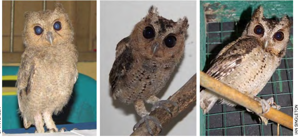
Plate 45: Young Collared Scopsowl at three different ages (left) 21 April 2011, (centre) 20 July 2011, (right) 7 December 2011.

A fledgling COLLARED SCOPSOWL Otus lempiji was rescued in Lamie, Nagan Raya, Aceh, on 21 April 2011, and held for a few months before its release back into the wild; photographs (Plates 45) show the same bird at three different ages [SvB, IS].