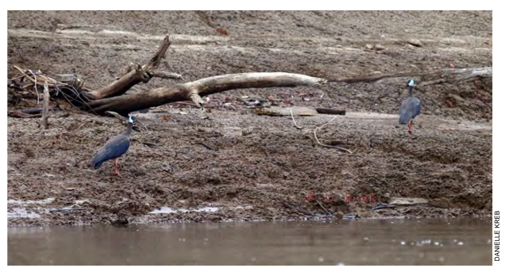
Plate 17: White-shouldered Ibises, Kalimantan Timur, 31 August 2007.