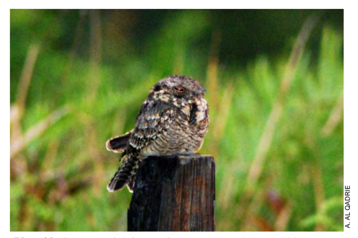
Plate 29: Savanna Nightjar, Kalimantan Barat, 4 August 2011.

Four SAVANNA NIGHTJARS Caprimulgus affinis were seen, and one photographed (Plate 29), on 4 August 2011 near Pematang Gadung village, Kalimantan Barat; this species has been in the area from at least the mid-1990s [AQ].