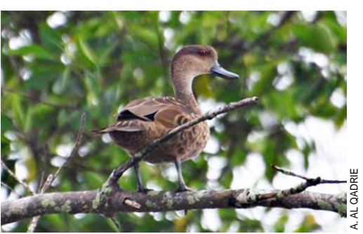
Plate 21: Lesser Tree Duck (left), Kalimantan Barat, 20 November 2009; Sunda Teal (right), Kalimantan Barat, 25 January 2013.