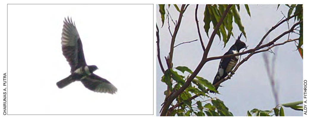
Plate 1: Black Baza, (left) Sumatera Utara, 25 December 2012; (right) Aceh, 10 January 2013.

and on 25 December 2012, seven were at the same location (Plate 1a) [CAP, DH]. In the late afternoon of 10 January 2013 two BLACK BAZAS were seen (Plate 1) in Krueng Raya, Aceh Besar (Aceh) [AF, FA, TW]; a late pair was seen on 19 May 2013 in Lamtamot, Aceh Besar [AF]. These four records are new for the provinces of Sumatera Utara and Aceh. The 2012-13 records appear to coincide with an abundance of Black Bazas seen in Singapore, being the most common raptor on passage in October, November and December 2012, with 104, 157 and 36 individuals, respectively (Tan 2012a, b).