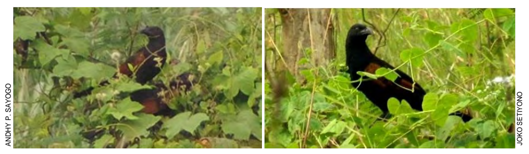
Plate 40: Sunda Coucals, Jawa Tengah, (left) 19 November 2010; (right) 30 August 2012.

On 19 November 2010 two SUNDA COUCALS Centropus nigrorufus were found (Plate 40, left) on Nusa Kambangan Island, Cilacap, Jawa Tengah, (7°44'S, 108°57'E), in lightly-wooded alang-alang Imperata cylindrica grassland along the main road through the island [APS]. On 30 August 2012 a single bird was perched amidst alang-alang and Passiflora flavicarva (Plate 40, right) in a production forest east of Putatsari village (7°01'S, 110°58 E), Grobogan Regency [JS, Sn], the first far inland record for Jawa Tengah.