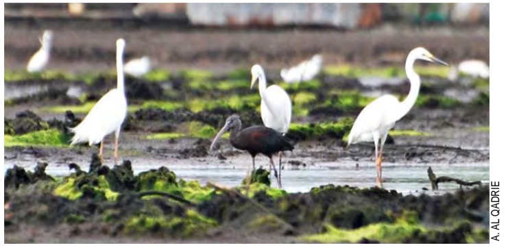
Plate 15: Glossy Ibis, Kalimantan Barat, 25 January 2013.

A single GLOSSY IBIS Plegadis falcinellus was seen in the Pantai Air Hitam (Ketapang) on 25 January 2013 [AQ: Plate 15]. This constitutes the first confirmed record of the species in Kalimantan since a 19<sup>th</sup> century record from Kalimantan Selatan (Smythies 1960); five more recent records from Kalimantan Timur and Kalimantan Selatan were unconfirmed (Sukardjo 1987; Holmes & Burton 1987).