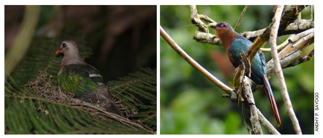
Plate 44: Emerald Dove (left), Jambi, 19 July 2011; Chestnut-breasted Malkoha (right), Jambi, 24 October 2011.

A CHESTNUT-BREASTED MALKOHA Phaenicophaeus curvirostris was observed and photographed carrying presumed nest materials on 24 October 2011 (Plate 44, right) near Durian Rambun village, Jambi [APS]