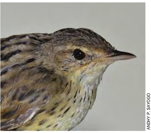
Plate 7: Lanceolated Warbler, Jambi, 10 April 2013.

At least two YELLOW-RUMPED FLYCATCHERS Ficedula zanthopygia were seen very well in Hutan Diklat (Pondok Bulu), along the Pematang Siantar – Parapat road, on 21 November 2012 [AC, AS]; one male (Plate 8) was seen in second-growth forest, at the base of Barisan Range, inland from Dolok Masihul on 27 November 2012 [AC, AS]. A female MUGIMAKI FLYCATCHER Ficedula mugimaki was seen in Hutan Diklat (Pondok Bulu), Pematang Siantar – Parapat road, on 23 November 2012, and two males (Plate 9) and a female on 26 November 2012 [AC, AS]. There are few Sumatran records of these two flycatcher species, and these are the first from Sumatera Utara province.