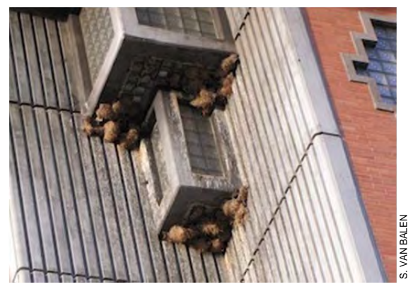
Plate 52: House Swift, Bali, 14 May 2012.

Many HOUSE SWIFTS Apus nipalensis were seen nesting in the air traffic tower of Ngurah Rai airport, Denpasar, Bali, 14 May 2012 (Plate 52) [SvB, DM].