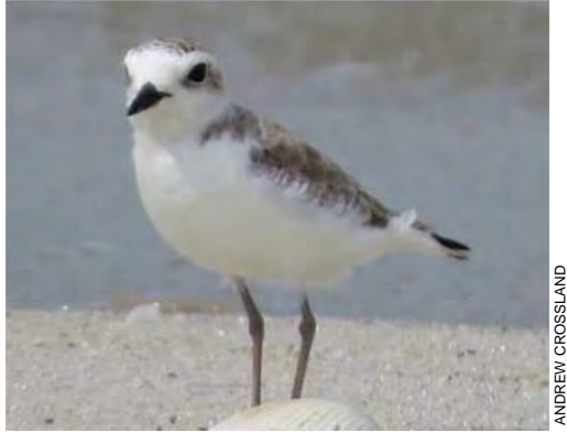
Plate 3: White-faced Plover, Sumatera Utara, (left) 29 November 2012; (right) 13 October 2010.

During a shorebird survey from 23-30 December 1995 along the Deli Serdang coast, Sumatera Utara, 200+ MARSH SANDPIPERS Tringa stagnatilis , 600+ ASIAN DOWITCHERS Limnodromus semipalmatus , 300 GREAT KNOTS Calidris