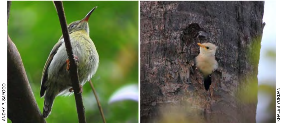
Plate 54: Javan Sunbird (left), fledgling, Jawa Tengah, 13 November 2010; Black-winged Starling (right), fledgling, E Java, 24 June 2013.

STREAKED WEAVER Ploceus manyar nests were found in trees in front of the head office at Ujung Kulon National Park, Labuan, Banten, on 30 April 2012 [SvB]. On 27 June 2013 a single juvenile BLACK-WINGED STARLING Sturnus melanopterus was watched leaving its hole at 5-8 m in a dead gebang Corypha utan tree (Plate 54, right) in Baluran National Park, Jawa Timur [KY].