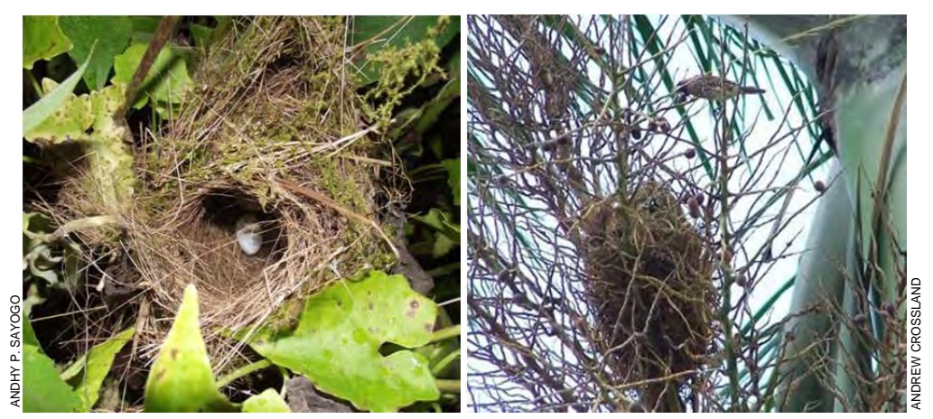
Plate 46: Hill Prinia nest (left), Jambi, 5 February 2011; Scaly-breasted Munia (right), Sumatera Utara, 20 September 2012.

A pair of MOUNTAIN WHITE-EYES Zosterops montanus with an active nest in roadside vegetation was seen on 15 September 2010 along the Pemantang Siantar-Parapat Road, Sumatera Utara, above 1,000m asl [AC, AS]. A pair of SCALY-BREASTED MUNIAS Lonchura punctulata (Plate 46, right) was found nesting in a palm tree in suburban Pemantang Siantar on 20 September 2005 [AC].