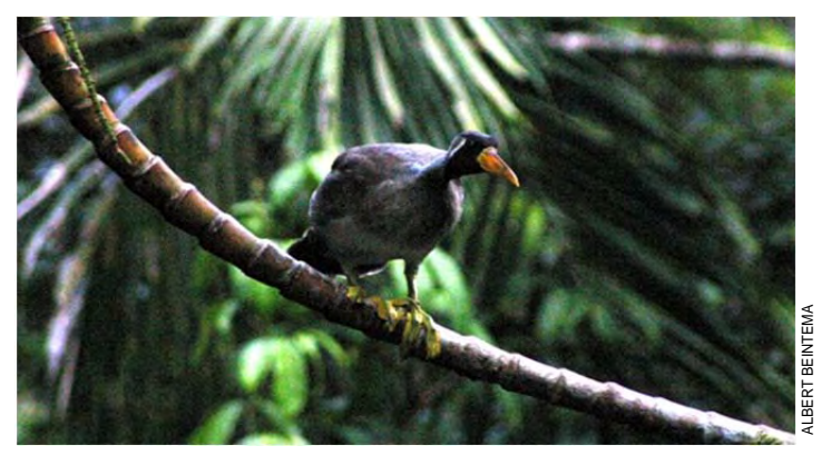
Plate 22: Masked Finfoot, Sarawak, 1 April 2004.