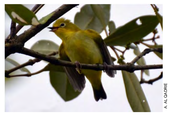
Plate 51: Javan White-eye, Kalimantan Barat, April 2011.

On 1 April 2011 a flock of JAVAN WHITE-EYES Zosterops flavus was seen with a fledgling which was fed by one of the adults (Plate 51) in the neighbourhood of Pematang Gadung village, Ketapang, Kalimantan Barat; an adult was seen carrying nest materials on 9 August 2011 [AQ].