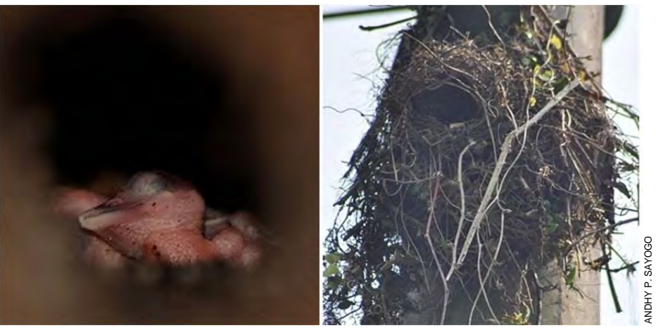
Plate 53: Oriental Dwarf Kingfisher (left), nestlings, Jawa Tengah, 9 November 2010; Banded Broadbill nest (right), Jawa Tengah, 18 November 2010.

A nest with two newly hatched ORIENTAL DWARF KINGFISHERS Ceyx erithaca (Plate 53, left) was found on 9 November 2010 on Nusa Kambangan Island, Cilacap, Jawa Tengah [APS]. Other interesting breeding records from the island include an active nest of BANDED BROADBILL Eurylaimus javanicus suspended from a telephone pole (Plate 53, right) which was found on 18 November 2010; a GREY-CHEEKED TIT-BABBLER Macronus flavicollis carrying nest materials on 20 November 2010; a female JAVAN SUNBIRD Aethopyga mystacalis with a fledgling (Plate 54, left) on 13 November 2010; and a fledgling SCALY-CROWNED BABBLER Malacopteron cinereum being attended by two adults on 12 November 2010 [APS].