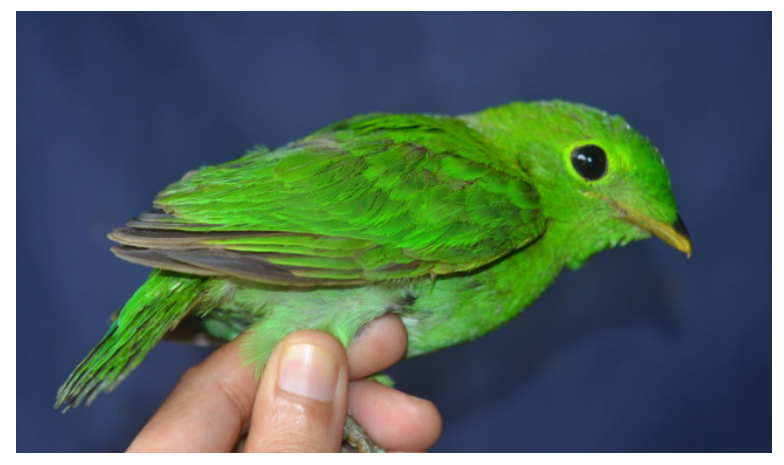
Plate 1. Green Broadbill Calyptomena viridis , a Near-Threatened species recorded during the present study, but not in previous mist net studies.

Five bird species listed by the IUCN (2012) as threatened or Near-Threatened were recorded in the present study: Large-billed Blue-flycatcher Cyornis caerulatus (Vulnerable); and Green Broadbill, Short-tailed Babbler Malacocincla malaccensis, Sooty-capped Babbler and Grey-chested Jungle-flycatcher (Near-Threatened). On the other hand, the previous studies reported two Vulnerable species and seven Near-Threatened species that were not recorded in this study (Table 1). As some of these species were captured only once, it is likely that they occur at low densities in the Park. Yet three Near-Threatened species (Rufous-crowned Babbler Malacopteron magnum, Puff-backed Bulbul Pycnonotus eutilotus and Rufouschested Flycatcher Ficedula dumetoria) were recorded by both previous studies, and it is conceivable that their populations have already declined. Approximately 79% of the birds captured in this study receive higher protection status (Totally Protected) in Peninsular Malaysia under Wildlife Conservation Act 2010 (WCA 2010), which is the most updated wildlife legislation in Malaysia. Given the lack of congruence between the IUCN's list of threatened species, WCA 2010 and the bird species that receive protection under SWLPO 1998, there is an urgent need to review and update the SWLPO 1998.