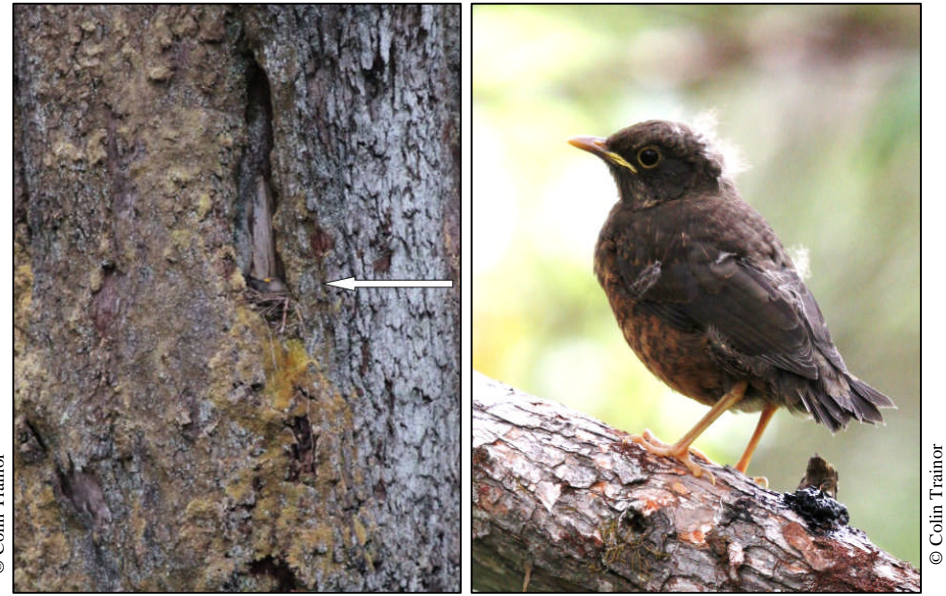
Plate 3. (left). Adult Island Thrush (indicated by arrow) sitting on nest in Eucalyptus urophylla tree, on Mt Mutis, West Timor; Plate 4 . (right) Recently-fledgled Island Thrush, Mt Mutis, W Timor.