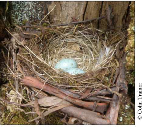
Plate 1. (left) Adult Island Thrush subspecies sterlingi at Mount Ramelau, East Timor, on 21 December 2009; Plate 2. (right) Nest and eggs of Island Thrush on Mt Mutis, West Timor.