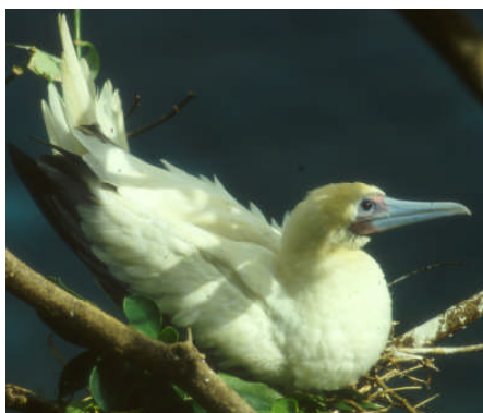
Plate 2. Brown morph Red-footed Booby nesting on Suanggi, July 2008.