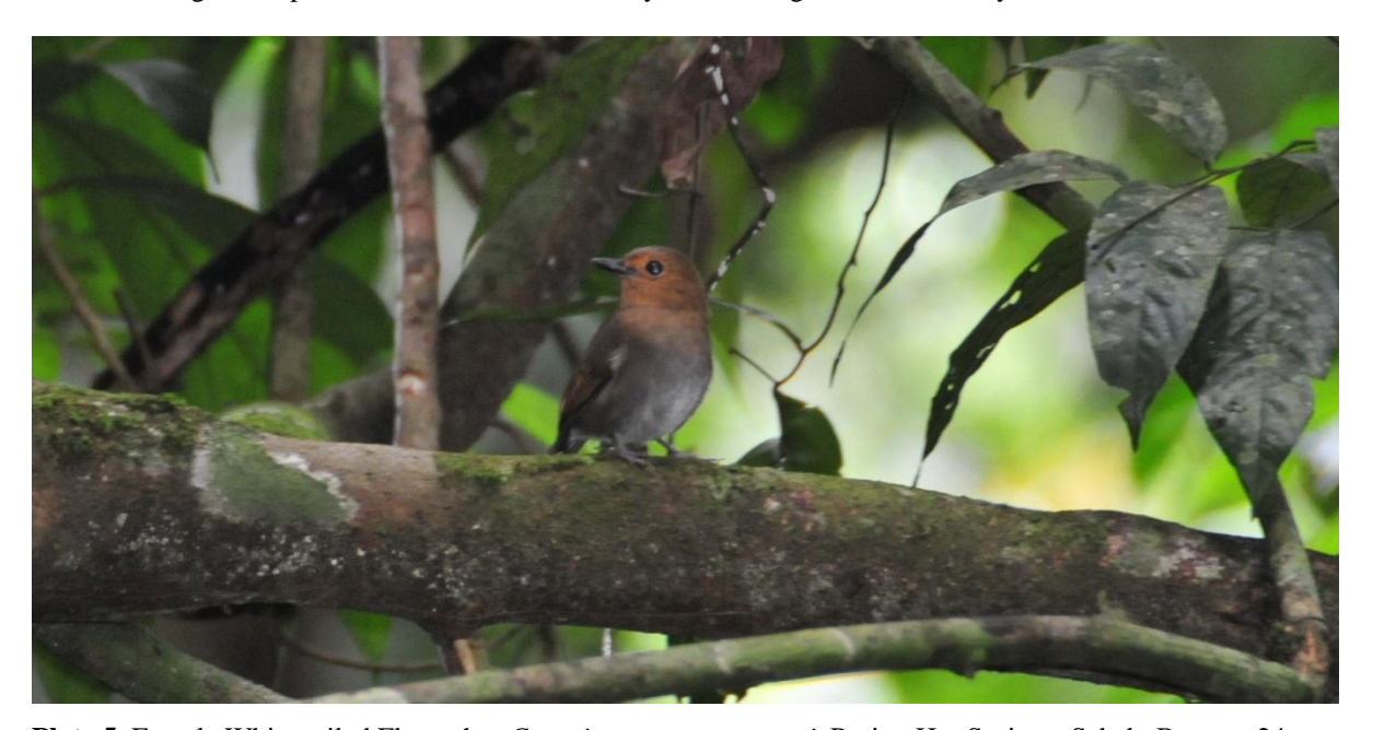
Plate 5 . Female White-tailed Flycatcher Cyornis concretus everetti , Poring Hot Springs, Sabah, Borneo, 24 October 2008, showing no white breast-patch but considerable rufous on the face to upper breast, and pale legs.