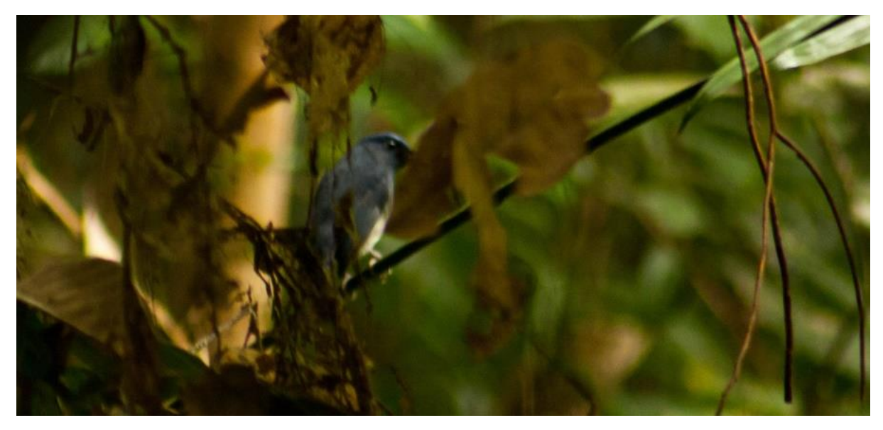
Plate 1. Unidentified male Cyornis flycatcher, 28 December 2013.