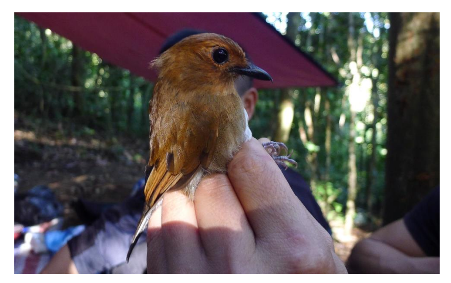
Plate 6 . (a) Female White-tailed Flycatcher Cyornis concretus everetti , Kinabalu Park, Borneo, 25 April 2015.