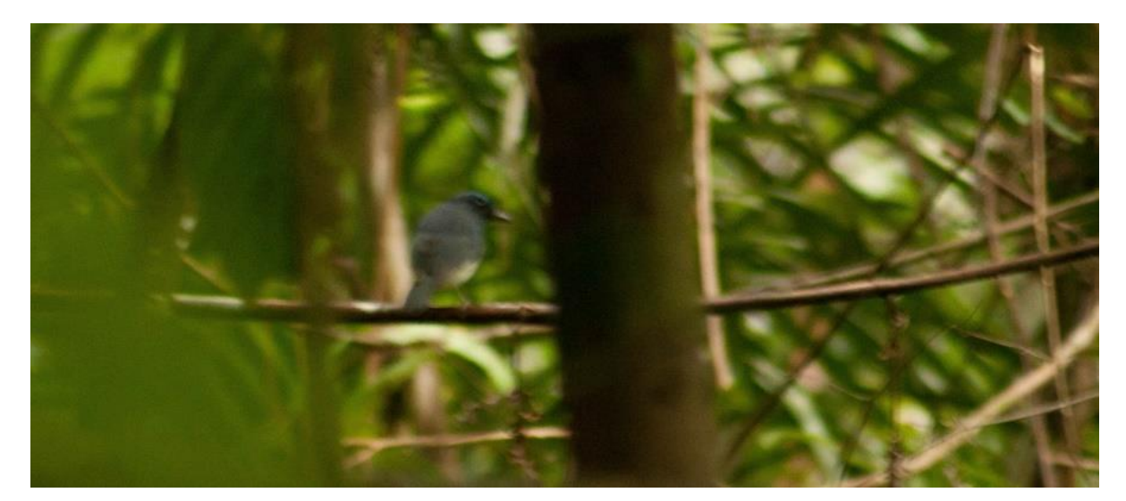
Plate 2. Unidentified male Cyornis flycatcher, 28 December 2013.