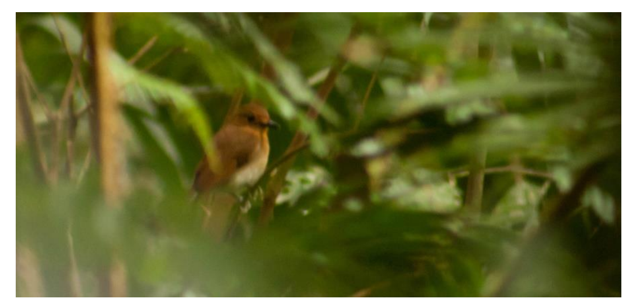
Plate 3. Unidentified female Cyornis flycatcher, 28 December 2013.