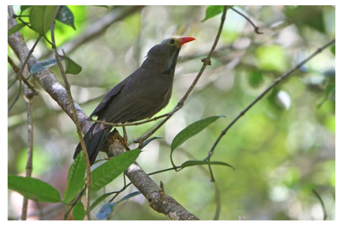
Plate 1. Bare-headed Laughingthrush Garrulax calvus from Mt. Kinabalu National Park, Sabah.